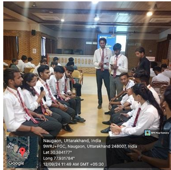
Students participating in the Debate on Implementation of NEP 2020